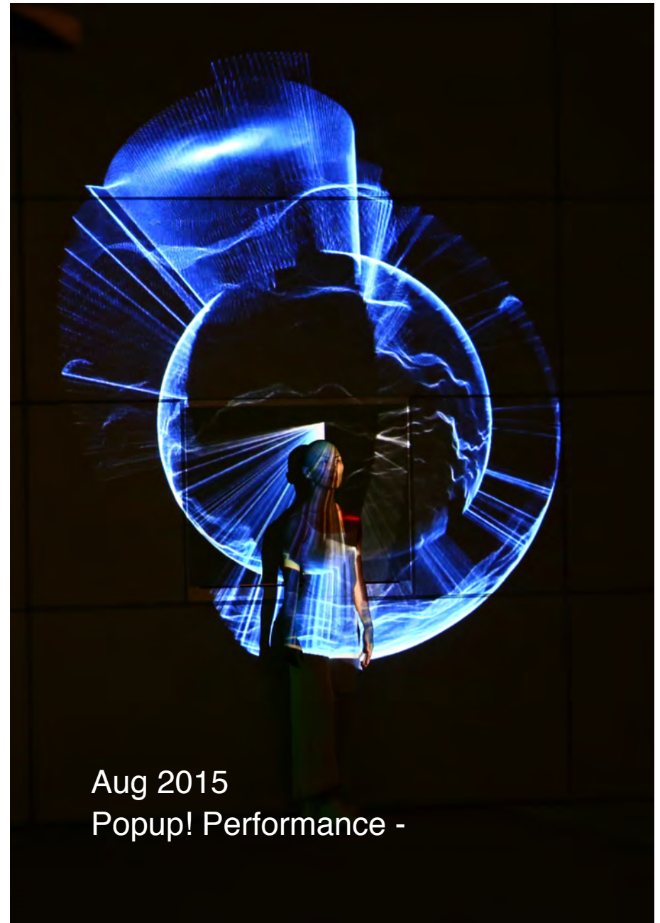
Aug 2015 Popup! Performance -