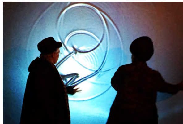
Dec 2015 MIZARU Open studio tour The Shirt Factory,